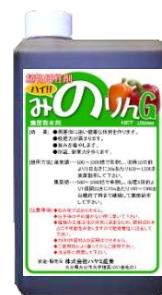
MINORIN (1 L)

※Don't mix MINORIN with alkaline agricultural chemicals or materials.