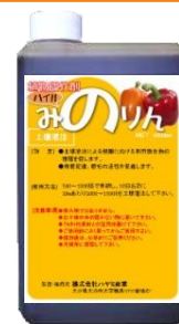
MINORIN Land (1 L)

※Don't mix MINORIN with alkaline agricultural chemicals or materials.